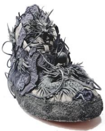
Individual Group -Male Footwear Winner The winner of Xinhaopan Group Awards -Nine Dragon Wall