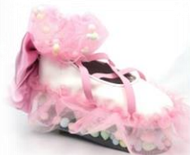
- Ballet Barbie