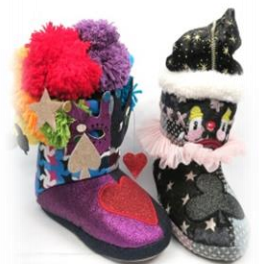
Individual Group - Children Footwear Winner